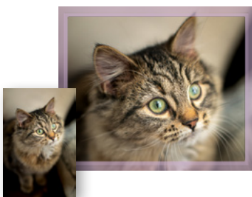
Small Urn: Pets 0-15kg Image area: 98mm x 82mm

Keep the important parts of the photo within the purple area, leaving some extra background around the outside to allow for trimming.