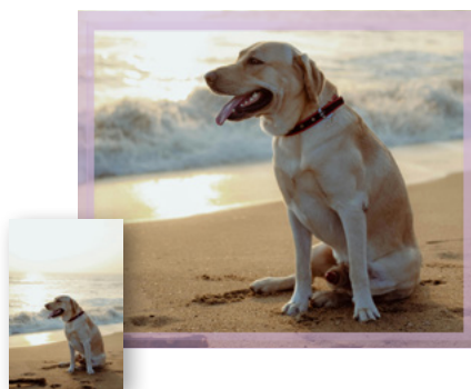
Medium Urn: Pets 16-39kg Image area: 129mm x 108mm