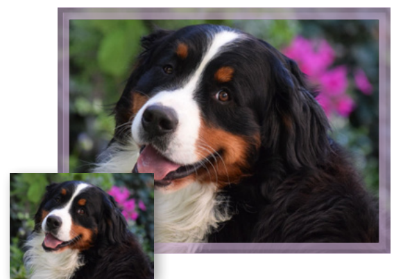
Large Urn: Pets 40kg+ Image area: 171mm x 127mm

Our designer will adjust your photo to fit the shape of the urn.